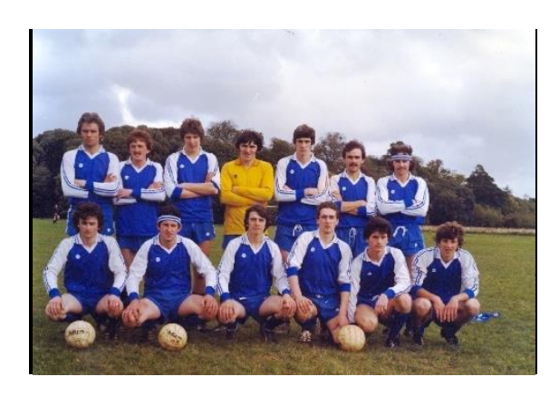
1979-80 (Winners of Kerry Section of Munster Junior Cup)